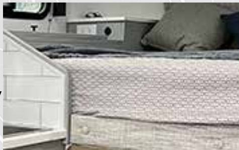
RESIDENTIAL STYLE MATTRESS

There are night stands on both sides of the bed, each featuring 110V outlets and 12V/USB chargers.